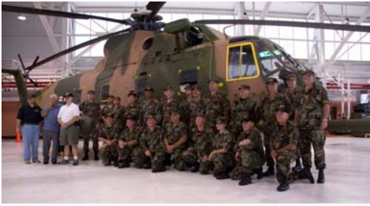
The crew responsible for restoring the HH-3E Jolly Green Giant pose in front of the aircraft at the unveiling ceremony on Sept. 6.