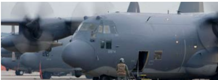
HC-130 and its crew from the 102nd Rescue Squadron, prepares to take off on a mission as part of the 2008 ORE exercise.