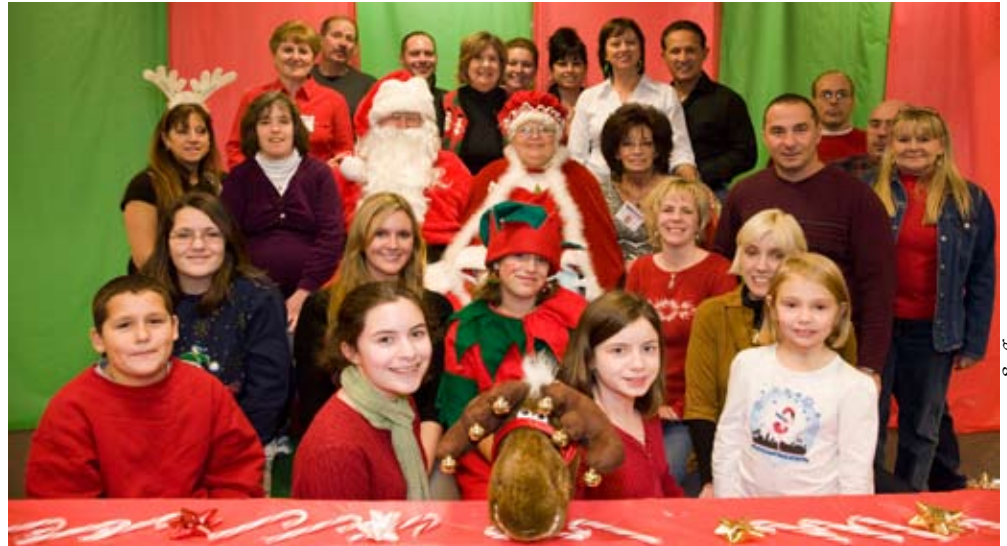
Members and volunteers from the 106th Family Readiness Group who organized the event.