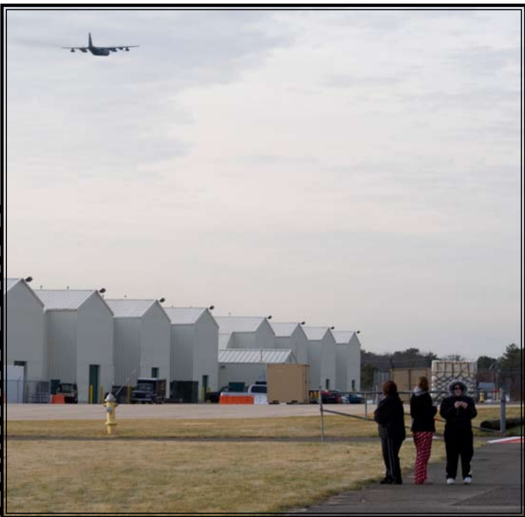
Family members watch as an HC-130 departs with their loved ones onboard.