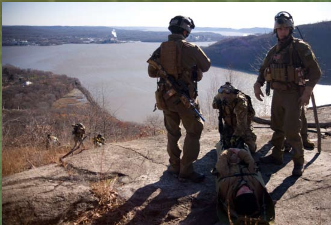
After hauling the simulated victim up the mountain the PJs assess the situation, regroup and plan their next movement.