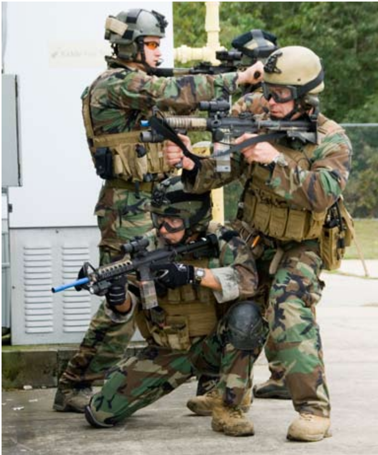
Pararescuemen take part in Military Operations on Urban Terrain (MOUT) at the Suffolk County Fire Academy in Yaphank, N.Y., on Sept. 30.